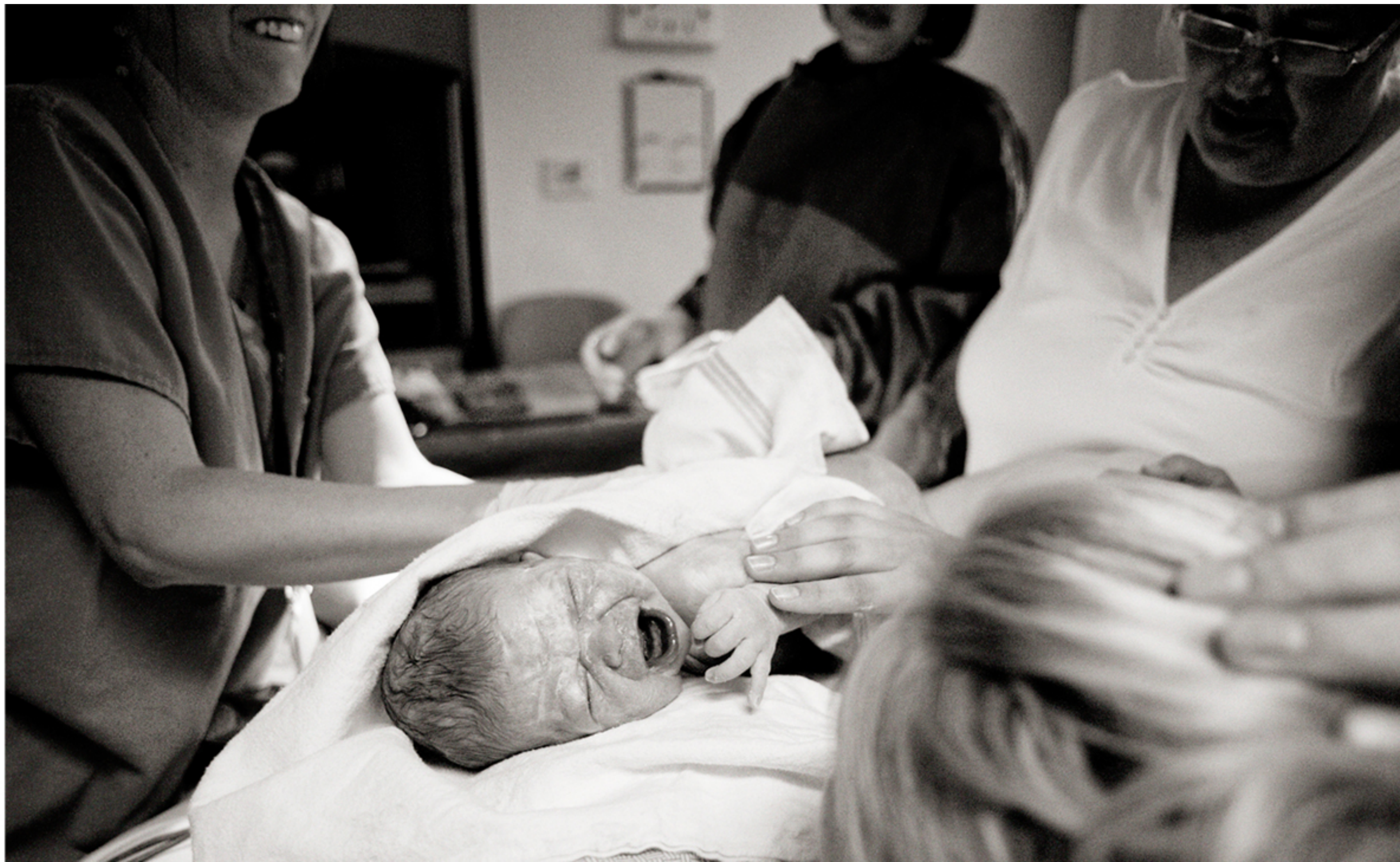
birth stories heather nan photography 2012 pricing